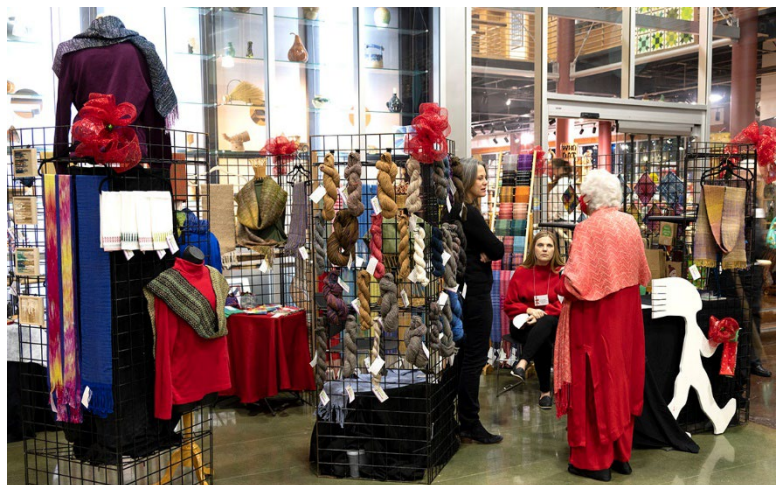
The CWSG Co-op participated in Chimneyville this year from Dec 1-3. More details of the event coming in the January newsletter.

Santa is bringing lots of presents for weavers and spinners – regardless of whether they have been naughty or nice. There will also be fiber gifts for those participating in the raffle and bingo games.